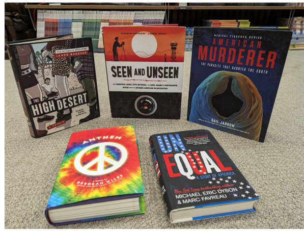
From left to right: The High Desert, Seen and Unseen, American Murderer, Anthem, and Unequal

Have you been to the Adult Literacy office Resource Room lately? If not, you might not know we have added new books to our collection for intermediate to advanced readers! Read about a few of them below: