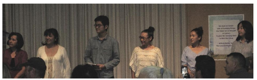
Student Authors featured in the 2018 Writing Collection: Impressions

Held Saturday, September 22, 2018, 4:30 pm – 5:30 pm in the Santa Rosa Čentral Library Forum Room