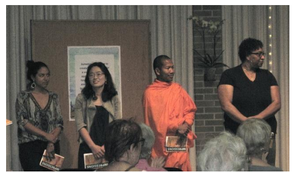
Student Authors featured in the 2018 Writing Collection