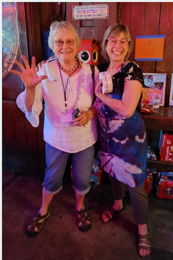
GIVE BACK TUESDAY