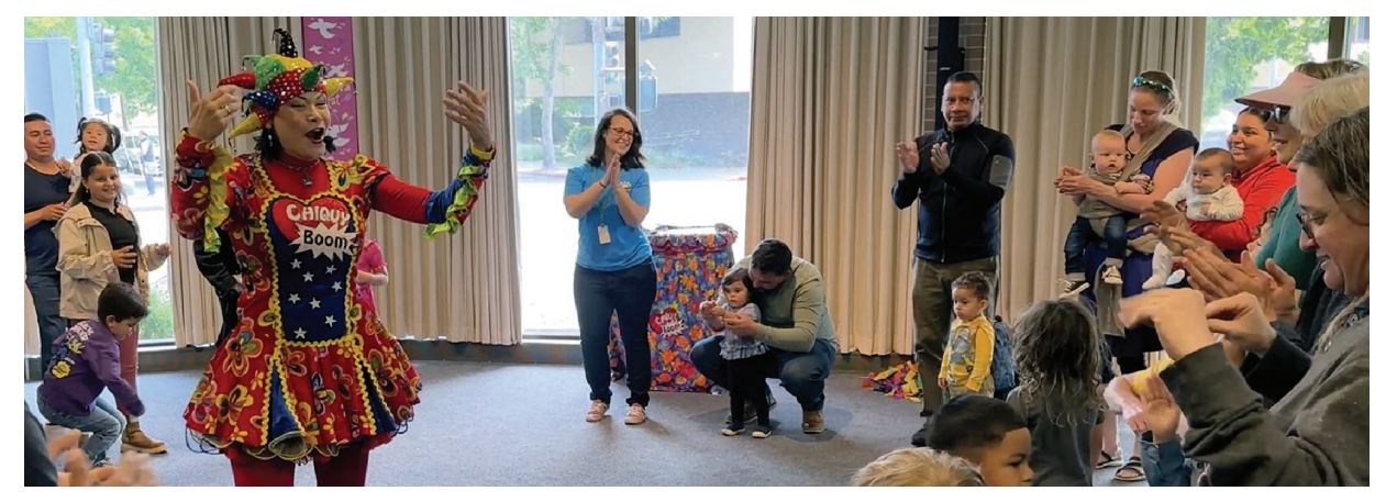
Lectura Fest at Central Santa Rosa