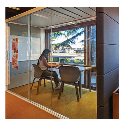
Petaluma Study Pod