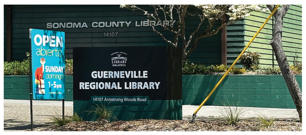
Monument sign at Guerneville Regional Library