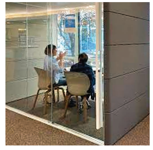
Rohnert Park-Cotati Study Pod